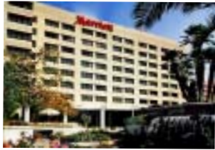
Long Beach Airport Marriott Hotel Single/Double $ 119.00/night

The PNAAP/ PNAAF does not promote or endorse the information or product discussed at this conference. It is our policy to ensure balance, independence, objectivity and scientific rigor in all of our sponsored educational programs. PNAAP/ PNAAF reserve the right to make changes, including canceling sessions/speakers if event occurs beyond the reasonable control.