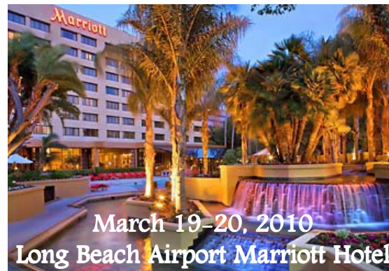
March 19-20, 2010 Long Beach Airport Marriott Hotel

Overview: Welcome to the beautiful Long Beach, California! Last July 2009, Philippine Nurses Association of America (PNAAP) celebrated its 30 th year as a professional organization. The current PNAAP President's mantra, PRISM (Professional Linkages, Regulatory and Legislative Agenda, Interagency Collaboration, Services and Program Development, and Managing Organizational Resources), provides the framework in its pursuit as a premiere ethnic association and celebrates the contributions of members to the healthcare arena.