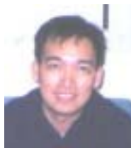
North Central Region Rizvend Pecana